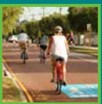
Safe Active Street