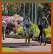
High Quality Shared Path