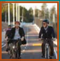
High Quality Shared Path