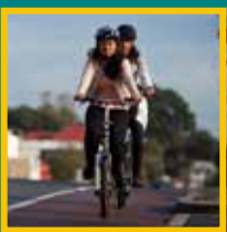
Bicycle Lane or Sealed Shoulder