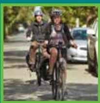
Local Bike Friendly Route