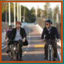
High Quality Shared Path