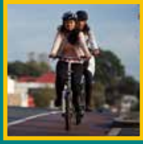
Bicycle Lane or Sealed Shoulder