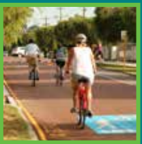
Safe Active Street