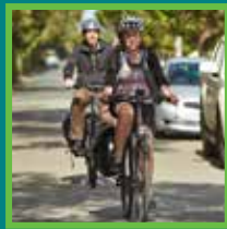
Local Bike Friendly Route