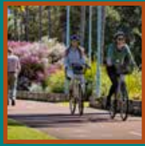
High Quality Shared Path