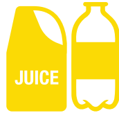
Plastic bottles and containers